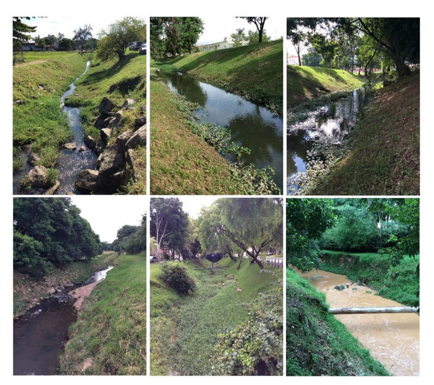
Figure 2. Representative stream stretches sampled from Sorocaba City.