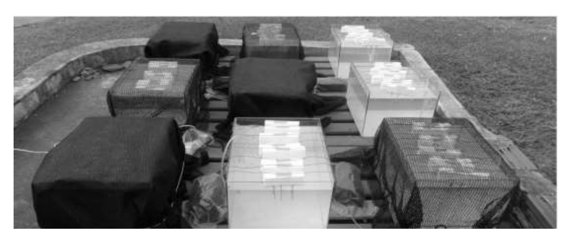
Figure 3. Random distribution of aquariums.

The Factorial Variance Analysis, at a significance level of 5%, showed that there was no significant variation of the biomass over time (F: 1.38, G.L: 6, p: 0.24). However, there is a significant difference between the treatments (F: 4.05, GL: 2, p: 0.024 -Figure 4), and this difference occurred between the