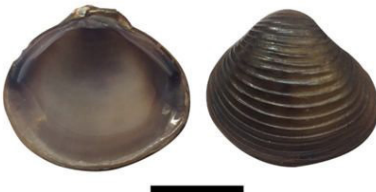
Figure 2. Internal and external views of valves of the Corbicula fluminea caught at Poxim-Açu River. Scale=1 cm.