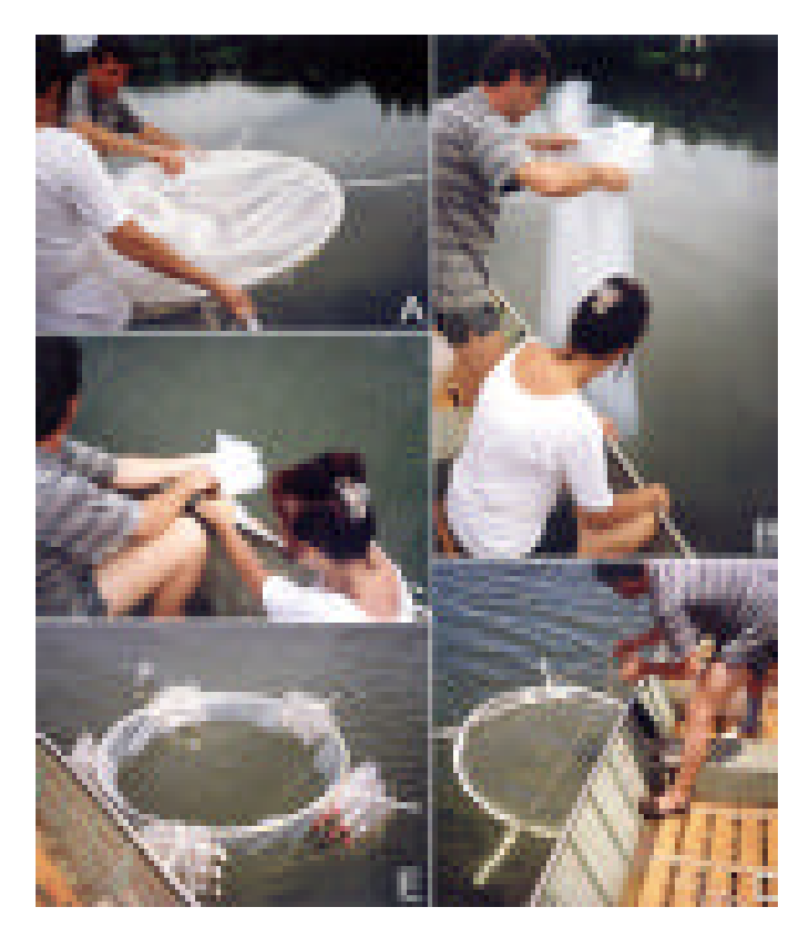
Figure 2: Sequence of pictures showing the procedure for setting the enclosure, closed to the sediment, in the lake.

emptying rope, longer than the bag length, seen in Figure 1, are bound; the upper end of this rope is previously tied to the boat and later, when the enclosure is already set, it is bound to one of the mouth bars. Then, the bag is filled by pulling the mouth ropes, which have been previously hooked to the tip of the mouth bars (Fig. 2D), and whose single upper end was kept bound to the boat during the enclosure setting. As soon as the enclosure mouth reaches the water surface, the floating units (six bottles each) are adjusted to the bars and bound to them with ropes, for preventing them to be blown away by the wind (Fig. 2E). The group of six bottles are adjusted to the bar, five beneath and one over it, in order to keep the mouth ca . 20 cm above the water surface (see Figs 1, 2E). It is recommendable to set the enclosure anchors in the lake the day before, leaving the ropes marked by buoys. In this way, when the whole procedure is finished, the enclosure is quickly tied to the two anchors (Fig. 1).