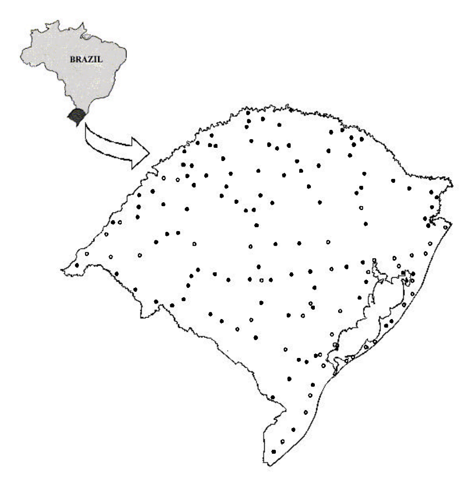
Figure 1: Wetlands sampled and distribution of aquatic pteridophytes in wetlands of the State of Rio Grande do Sul. ● sampled areas Copresence of aquatic pteridophytes.

The diversity of aquatic pteridophytes corresponds to the number of collected species in each sampled area. Samples which were deposited in herbaria and previously published studies were not taken into consideration in the analysis of the diversity and distribution of the species. Wetland localization was determined using Global Position System (Personal Navigator, model GPS III Plus). The frequency of species occurrence was classified as constant (100%), frequent (99-50%), sporadic (49-10%) and occasional (9-1%) (Ávila, 2002). Linear regression was used to analyze the correlation between pteridophytes richness and wetland area, and altitude.